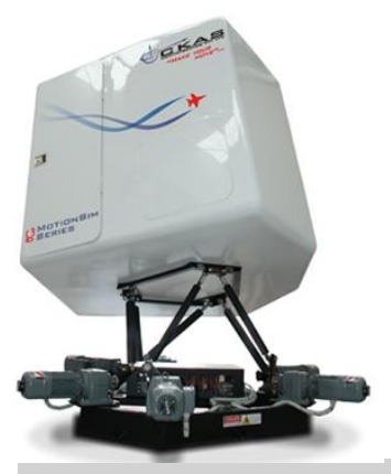
Some simulators require expensive hardware

crasning a plane in a flight-sim is safe.