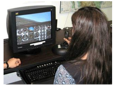
PC flight sim for use in the home

Some driving simulators are for entertainment purposes like Test Drive Unlimited 2