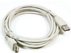
Figure 2.6 USB connectors