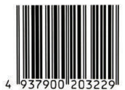
Figure 2.4 A barcode