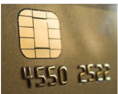
Figure 2.3 The chip on a smart card