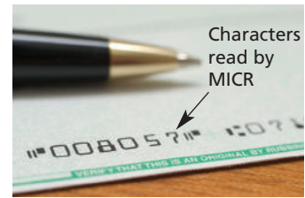
Figure 2.5 A bank cheque

Magnetic ink character recognition (MICR) is a system which can read characters printed in a special ink (containing iron particles). Only certain characters written in a standard font can be read, for example the characters at the bottom of a bank cheque (see Figure 2.5). These characters are converted into a form that the computer can understand and then stored in a computer file.